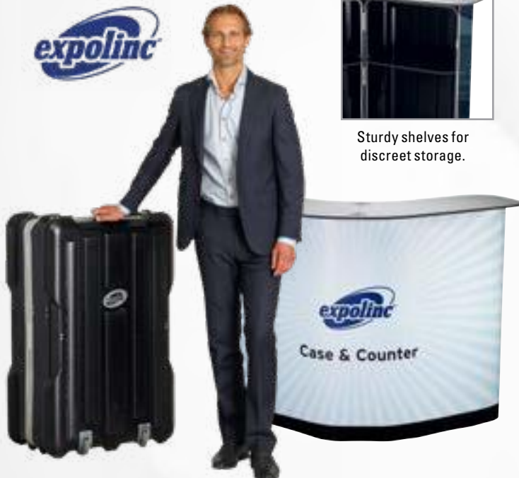
Sturdy shelves for discreet storage.

See How Easy it is to Set Up a Case and Counter